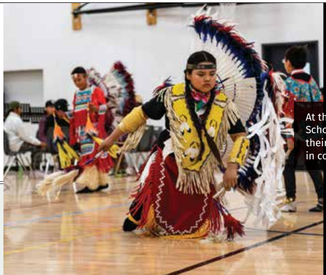
At the Mamawi Atosketan Native School celebration, parents watched their children doing traditional steps in colorful regalia.