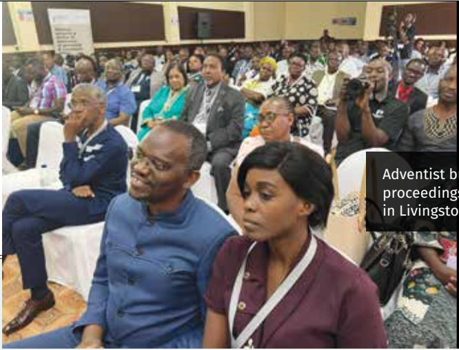
Adventist businesspeople listen to the proceedings during the recent ASi Convention in Livingstone, Zambia.