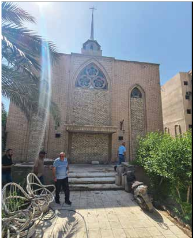
The Basrah Adventist Church stands empty as it awaits renovation.